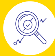
Data and Analytics