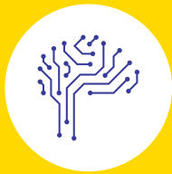
AI and M2M