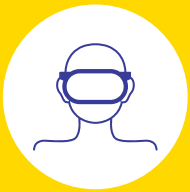
AR, VR & Mixed Reality