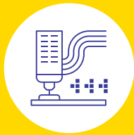
3D Printing & Prototyping